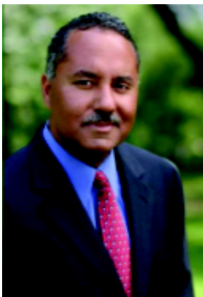
Ain't No Party Like an OPP Party!